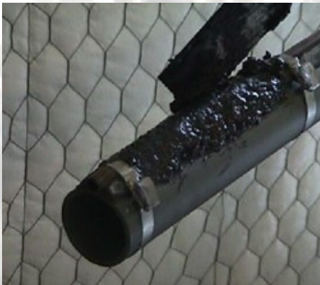
Typical hand trowel application